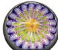
Awards created by Epiphany Glass of Pontiac Michigan