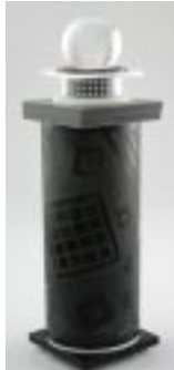
Carolyn Bennett Matrixo