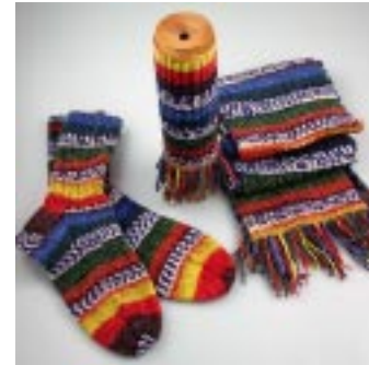
Alice Houser Argyle Dream