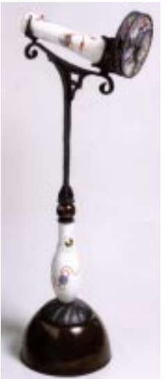
Koji Yamami Temari (Happy Ball)