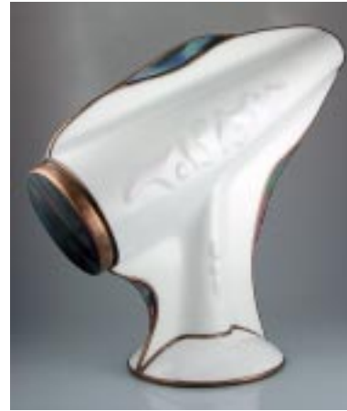
Charles Karadimos Classic #8