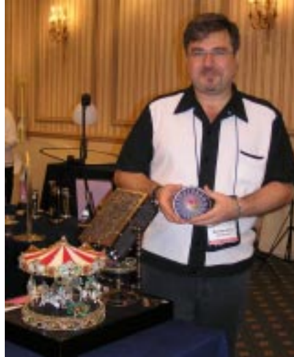
"A Childhood Dream" by Massimo Strino is a carousel decorated with Swarovski crystals on a turntable with Murano glassbeads and features 2 music boxes and LED lighting. Three mirror systems are incorporated into this winner, a 2-mirror, 9-point system, a chorus line system, and a 3-mirror 45-45-90.