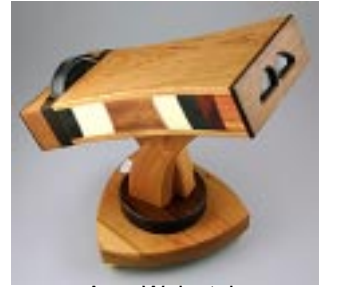
Amy Weinstein Opus