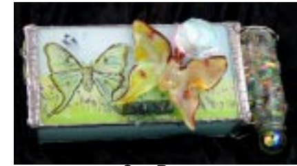
Sue Ross Luna - Nature's Window